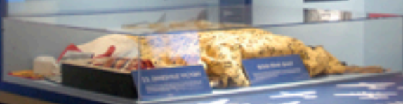
U.S. COAST GUARD VESSEL MUSKINGUM COUNTY