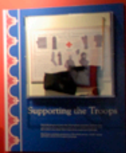
Supporting the Troops